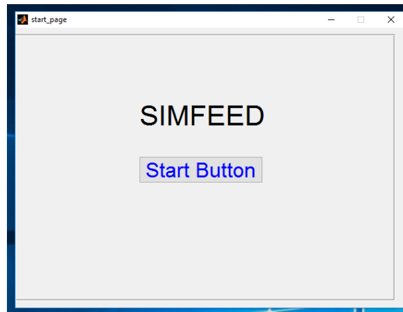
Figure 1. Initialization of the simulation tool

After selecting the Start Button, the next step is to select the animal type and weight class for whom balanced feed mix is to be formulated (Figure 2). After selecting the animal, its class and weight, the next step is to select the desired feed ingredients for the selected animal. It can be done by selecting the Feed Ingredients button on the same screen (Figure 2).